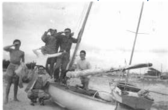
Ready to leave Elwood