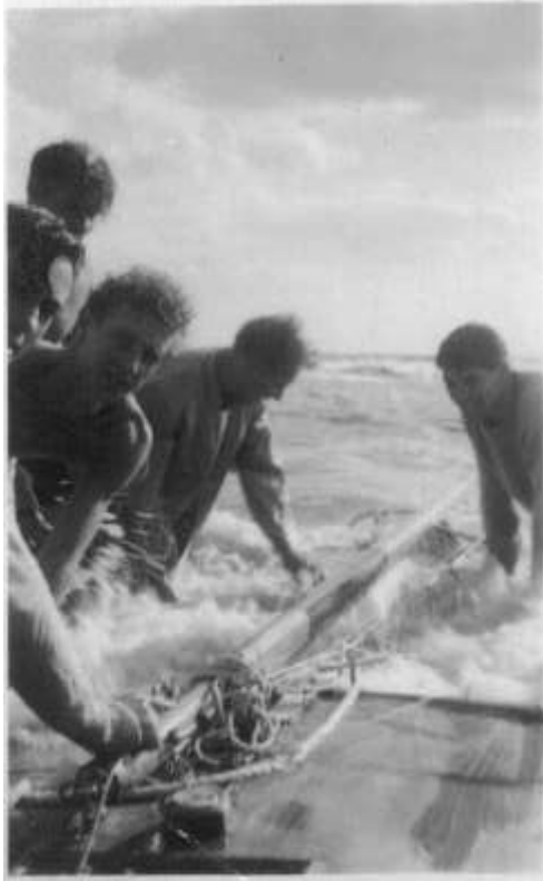
Save the Boat-Mid 1950s