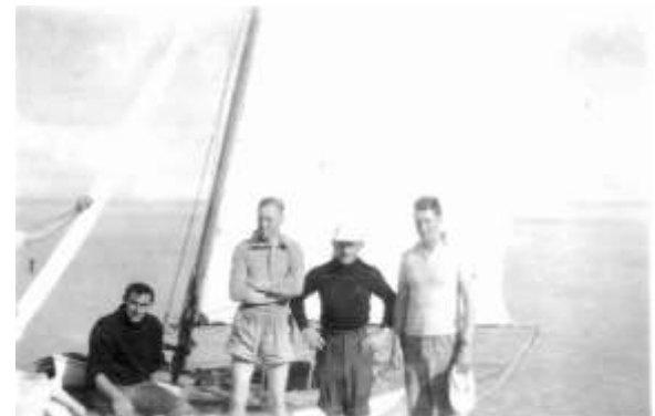
Crew of E33 Mustang