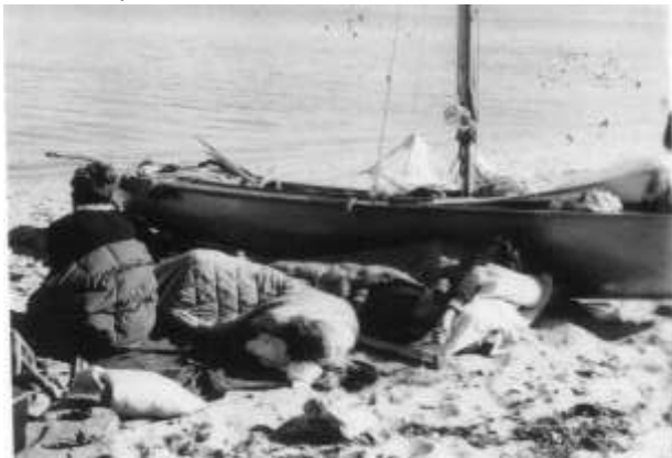
Camping on the Beach at Canadian Bay