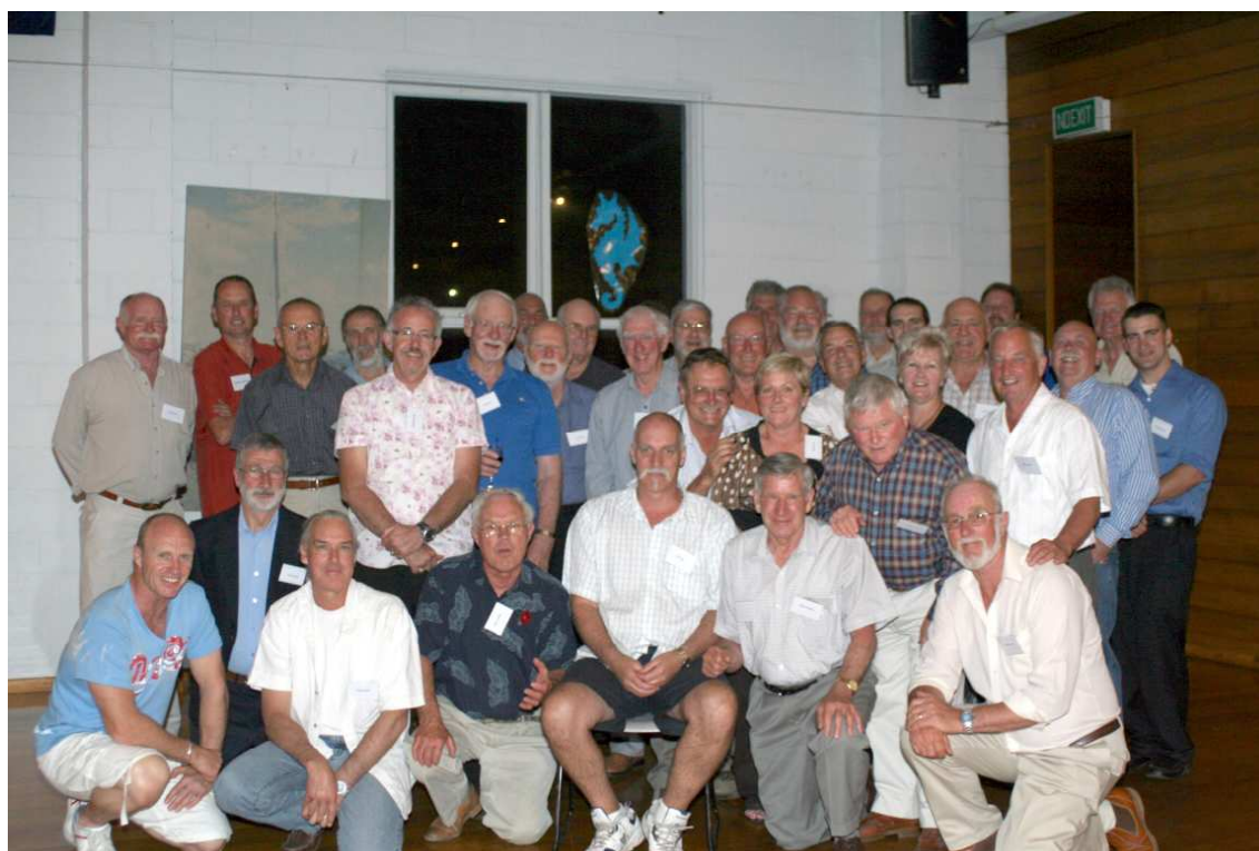
The Elwood Seahorse old boys and girls on the night.