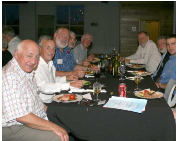
More happy members at the dinner.