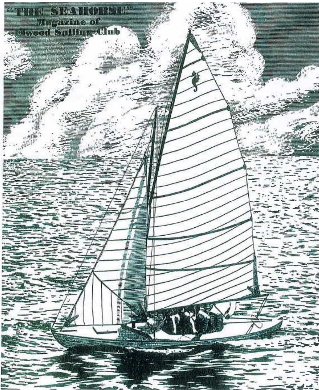
Season 1941 – 1942 Magazine Cover